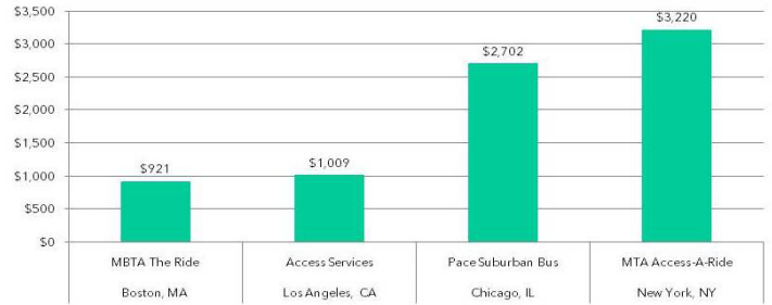
Cost Per Eligible Rider

Some notable facts presented in the survey were that Access Services leads the nation in percentage of advance reservation trips (versus subscription trips) and has the largest service area population at approximately 9.8 million people; Access Services is second in the nation in average weekend ridership, number of registered riders, productivity, and average applications received monthly; Access Services ranks third in the nation only behind New York and Chicago in total trips completed, average monthly ridership, and weekday ridership.